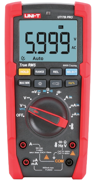
● UT17B PRO